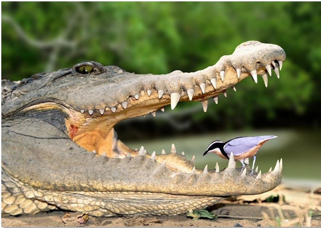
Figure 1. Nile crocodile and Egyptian Plover

In order to help explain how I believe I have been working with my students and in turn what my understanding of a symbiotic relationship is I use the metaphor of the Nile crocodile and Egyptian Plover. Both of these organisms live in a mutually beneficial relationship; a symbiotic relationship. Parasites can be found in the mouth of the crocodile which the Plover removes. In this way the Plover gets fed while the crocodile gets its teeth cleaned. I believe that the students perceive me as the 'expert-knower' and in turn as the crocodile, the animal with the power to shut its mouth and crush the student. However, for this relationship to exist it must be noted that both animals are each as important as the other. Throughout this paper I hope to demonstrate that it has been possible for my students to have learnt with me as I gain a better understanding of how I can best develop my practice.